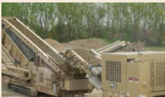
Made to Match

The FT3620 FNG matches with other FT products from KPI-JCI without the use of off plant stackers to create a complete mobile production system.